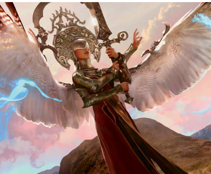
Exquisite Archangel — Brad Rigney