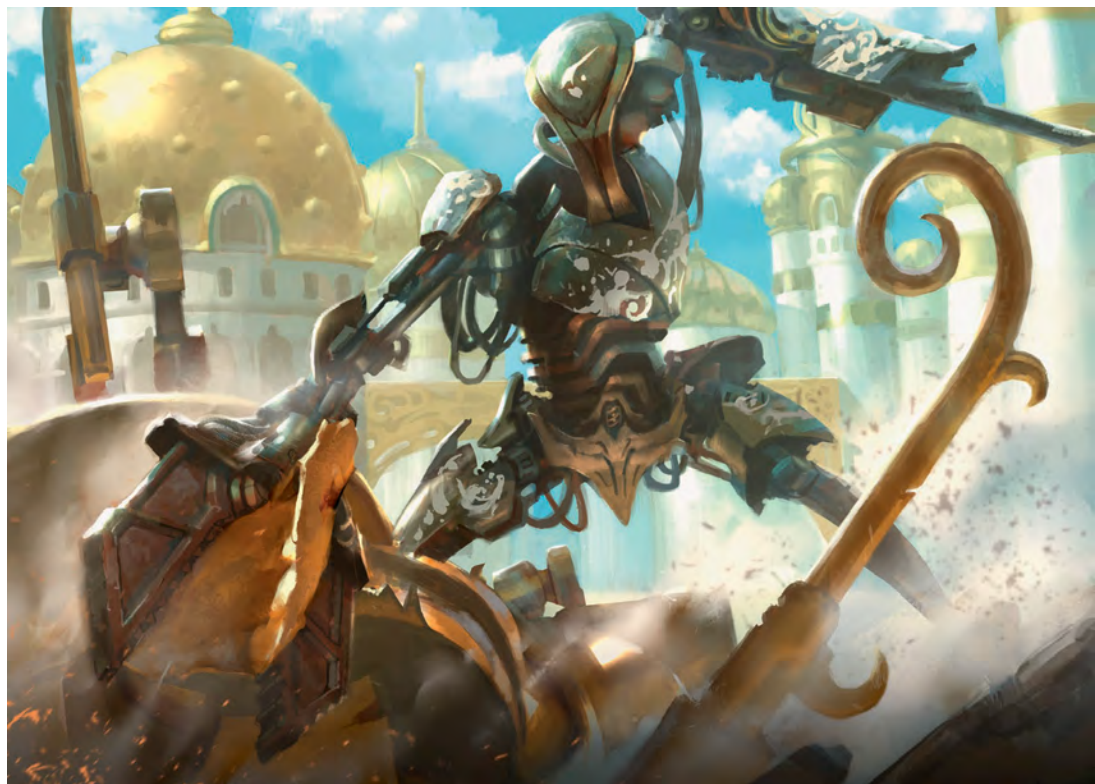
Prizefighter Construct — Daniel Ljunggren

Almost any creature in the Monster Manual with the construct type could be used as a construct on Kalladesh, including animated armor , helmed horrors , shield guardians , and modrons .