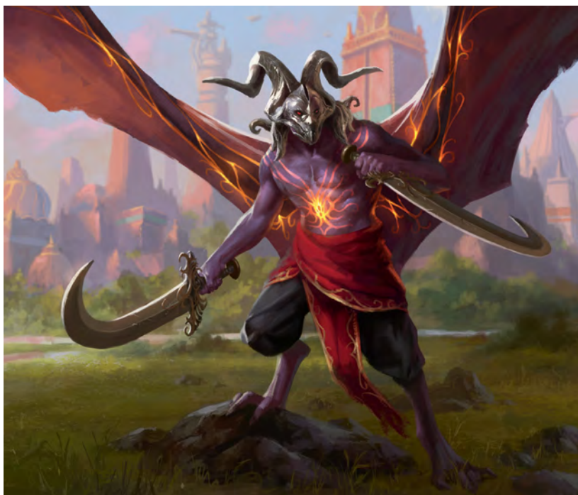
Demon of Dark Schemes — Daarken

The statistics of an erinyes work well for demons on Kaladesh, but their weapons deal extra necrotic damage rather than extra poison damage.